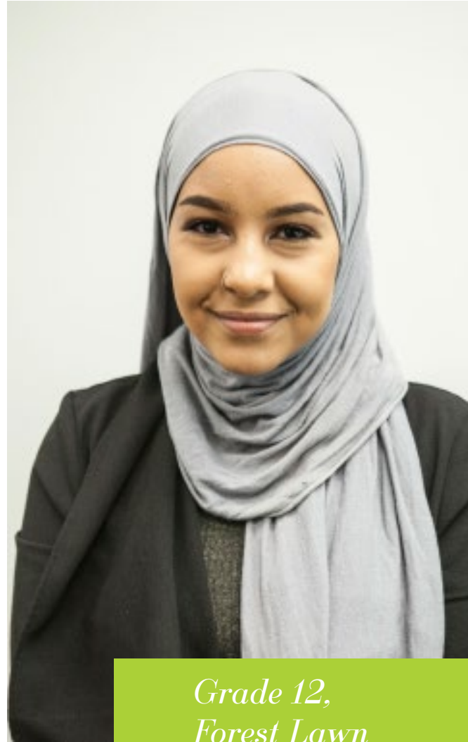
Grade 12, Forest Lawn High School

kind and accepting. Other than homework club I am involved in model UN club at Forest Lawn High School, which is an extracurricular activity where students enact the United Nations and imitate UN committees. After students get all the information they need on the country they are given, a conference is held at a high school or university. At the end of the conference, the outstanding delegates in each committee are given an award. Other than Model UN I am also apart of United for Africa club. Forest Lawn and many other schools around Canada will fundraise money to build an orphanage in Kenya. I was also on the Forest Lawn rugby team in 2015 and I plan on being on the team this year if it does not interfere with my school. Outside of school I also volunteered for the Canadian Breast Cancer Run for the Cure in 2012 and also for the Being Me conference in December 2016. Both of these were really amazing experience for me because I got to meet so many amazing people and also it felt really great to get involved and give back to my city.