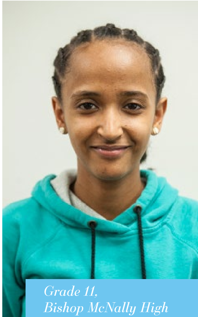
Grade 11, Bishop McNally High School

I think I deserve to get the scholarship because I have all the requirements and also because I want to make my mom proud as this would be my first scholarship or any award for the matter to win for me. Also to motivate me, to be strong and keep working harder as life has not been easy on me. Lastly I want to end this by saying thank so much to everyone who is part of the scholarship program and also the supports of CBFY for they have helped me since day one of my school life here in Canada. Be blessed and live long to help more and more newcomers in Calgary. Even if I don't get the scholarship I know someone will and they would have been helped. Thank you for the opportunity.