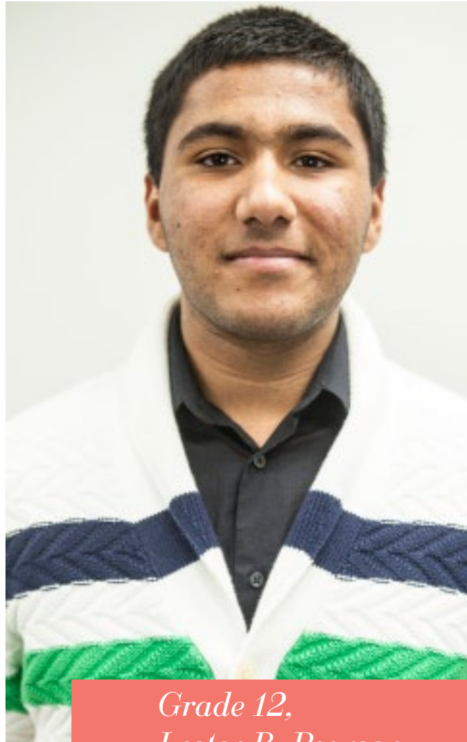
Grade 12, Lester B. Pearson High School

in Calgary so that I can continue working with the CBFY. I had the passion of becoming a Mechanical Engineer since my childhood. I used to observe my father operating various heating systems, power generators, and boilers. My father used to discuss about the