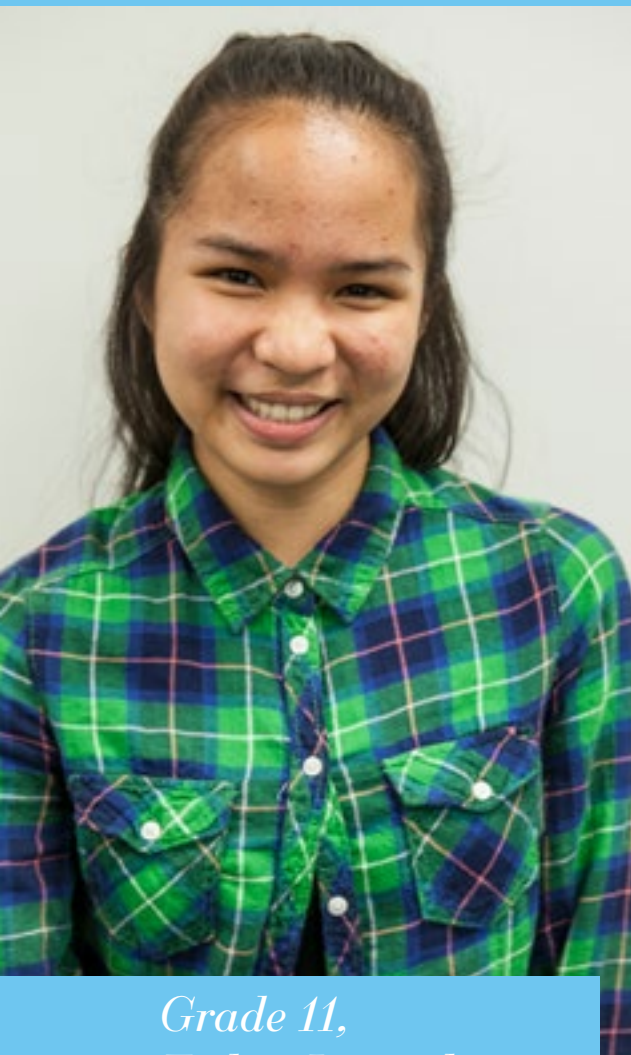
Grade 11, Father Lacombe