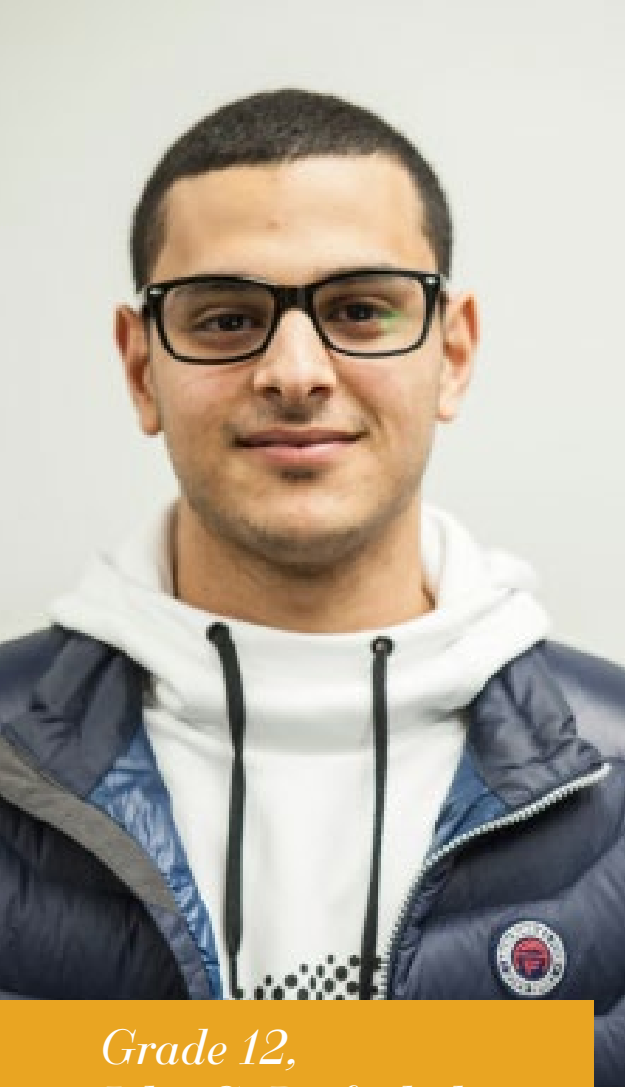
Grade 12, John G. Diefenbaker

and track and field. In the last two years I played in school teams in both sports and excelled. My basketball team in grade 9 was undefeated all season. I also did swimming and completed Bronze Medallion course at Thornthill Recreational Center.