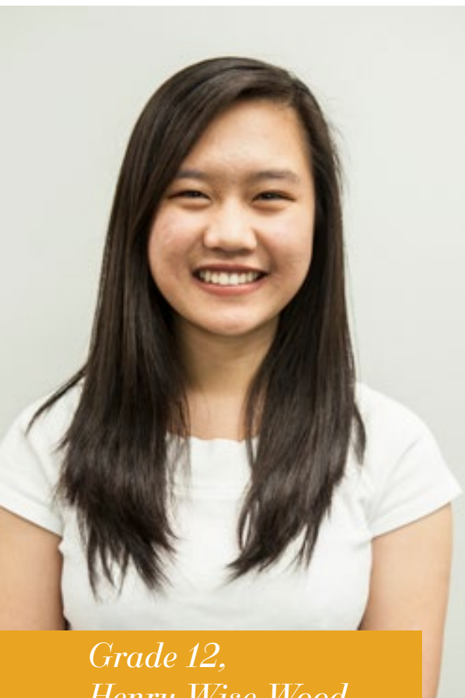
Grade 12, Henry Wise Wood

confident; I was inspired. As time passed, my courage built up; I decided to volunteer, and I loved it. Since then, I've made sure to sign up for a project or event whenever I have the time; I've collaborated with a group of volunteers to mentor grade school students in math and science in the Calgary Public Library. I also volunteered with Youth Central in fun, various activities such as assisting seniors in field trips to the Calgary Zoo and the Stampede. I also currently volunteer as a peer mentor with the CBFY Mentorship