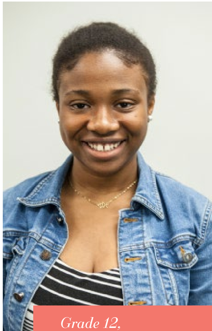
Grade 12, John G. Diefenbaker

I finally met a girl who, to this day, is the closest friend I will ever have. I felt like she was God-sent and my guardian angel. She was already late to her math class when she saw me roaming the hallway looking very lost. Instead of just ignoring me, she walked up to me and asked me where I was going and I showed her my schedule. She introduced herself