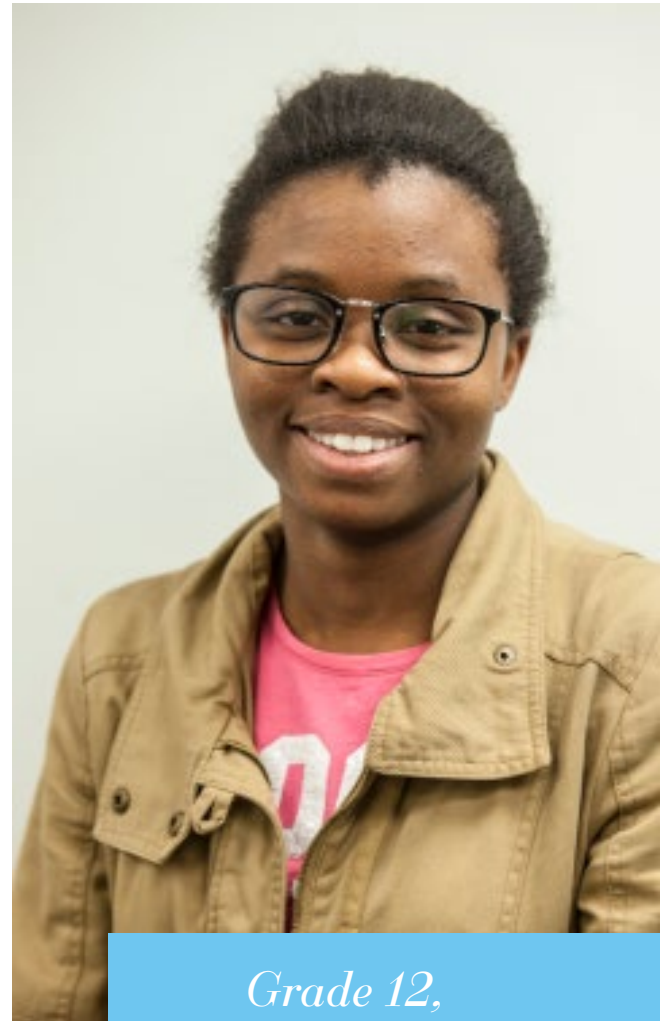
Grade 12, Bishop Grandin

I have been involved in the Mentorship Program since 2015. It has been a great experience for me to be part of CBFY. I chose to join this program because it had plenty of advantages such as the reinforcement of my ability to speak English, learning how to lead groups, more volunteering, and helping others in need (especially newcomers). Furthermore, this program presents opportunities and enjoyments such as pizza parties, field trips, chance of making new friends and also winning a scholarship award. Beyond these activities, we also have guest speakers who basically talk about different things that we didn't know about. Personally, I think they are great topics because we get to know about what we should do or not do to improve living in society. The important point that spoke to me was the helping of newcomers. When I first arrived, I did not have anyone to help me. I wanted to be able to help others, so they don't have to go through all the difficulties I had to confront.