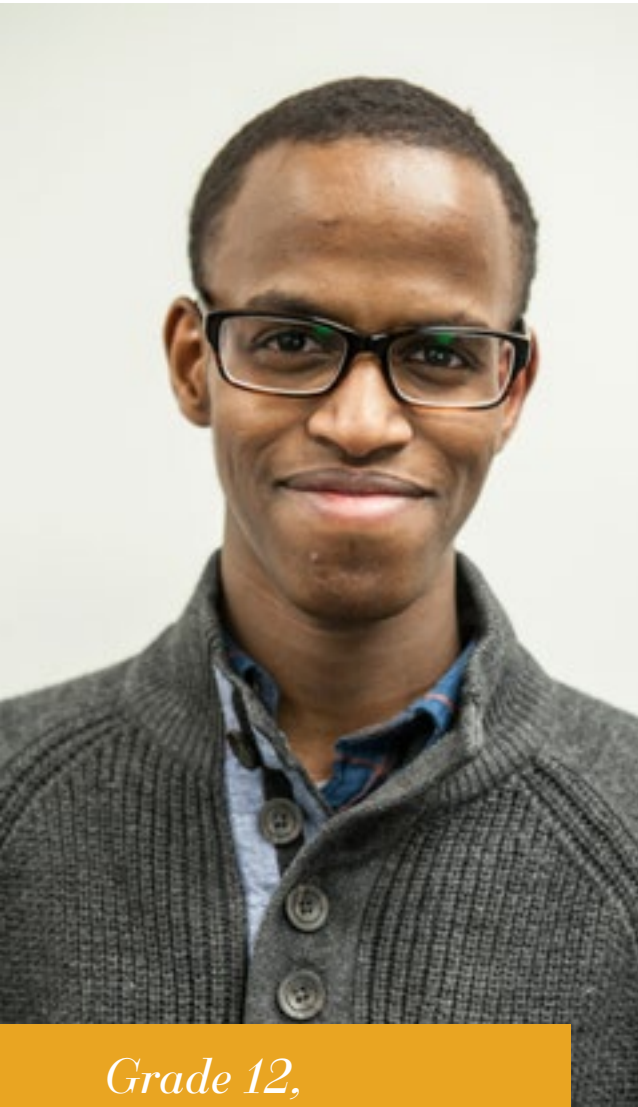
Grade 12, John G. Diefenbaker

I have a dream to become an electrician and winning the scholarship award would make a big impact in achieving my aspiration. The money will surely help me in my educational journey. I want to become an electrician, believe by doing that, I can help to repay some of the goodness that I have received from the government and the people of Canada. My dream is to contribute to the society that I am living in, the society that welcomed me and assisted me to become who I am today.