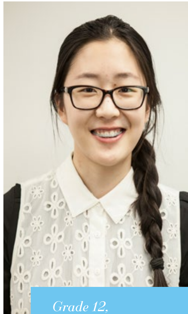
Grade 12, John G. Difenbaker

My future career goals revolve around the field of psychology. I find psychology a fascinating subject in which I want to acquire much more knowledge.