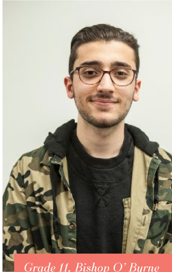
Grade 11, Bishop O' Byrne

I had meeting newcomers from various countries including my own was unbelievable. It felt amazing to give back to the community that helped me personally when I was a newcomer. So after the summer program I was given the opportunity to be a peer mentor at my school Bishop O' Byrne with the mentorship program. Becoming a full time peer mentor was definitely one of the best choices I have made so far since I came to Canada.